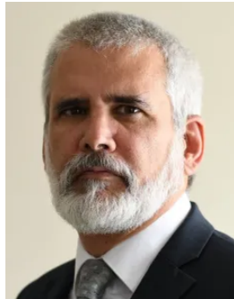
Dr. Robert W. Malone , gene therapy, bio-defense, vaccines and immunology; discoverer of in-vitro and in-vivo RNA transfection and architect of mRNA vaccine platform